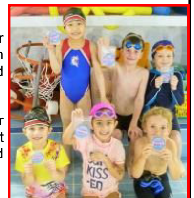
Tuesday Level 1 class with their badges

For more information on Multi-Sport's swimming programme and to sign your child up please visit our website: www.multi-sport.com.hk or call our office: (852) 2540 1257