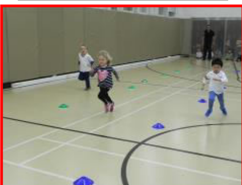
Running during Junior Sports