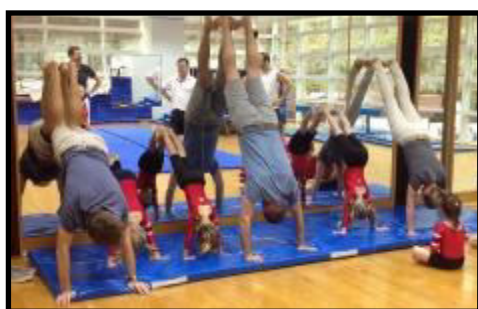
Handstands at parent invitational

With the summer season now upon us, it is important to prepare your child for properly for every lesson. Ensure your child has a bottle of water to re-hydrate during lessons including during swimming lessons.