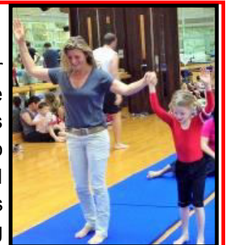
HKCC parent and child lesson