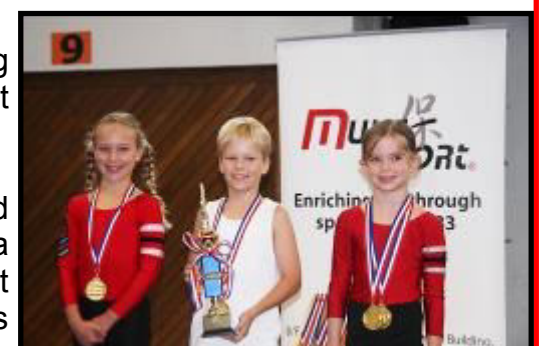
2014 Aged 7&8 Winners

For more information and to register for the event, visit www.multi-sport.com.hk . The Multi-Sport Gymnastics competition is a fantastic event to conclude the years gymnastics programme.